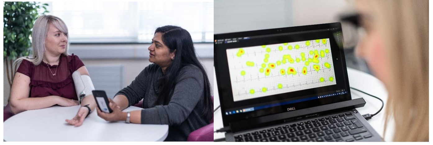
Figure 2 showing the environment and equipment developed as part of this proposal.

The main environment within the living lab is a large reconfigurable seating/ discussion area, with private spaces for eye tracking and brain computer interface (BCI) experiments, a virtual immersive environment for research into virtual and augmented reality, and a control room (hidden by one-way